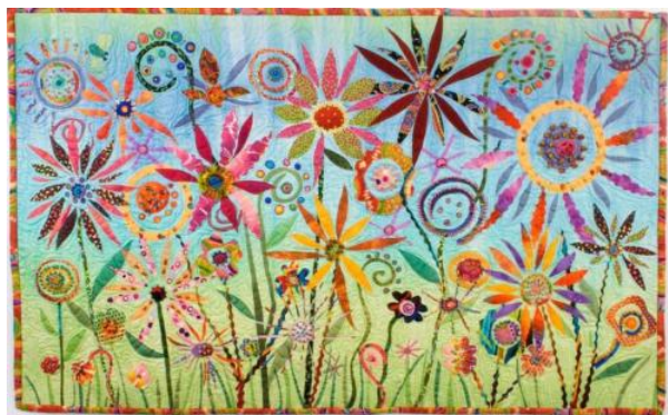
Quilt by Lynn Woll