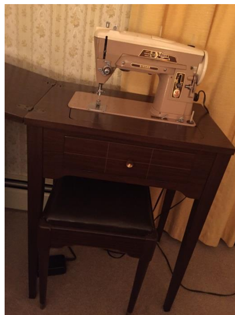
Vintage Singer in cabinet with stool

This is Lois' Singer Class 403, purchased approx. 1960 and slightly used. We cannot find the serial number. There are many patent numbers. Let us know if we can be of further assistance. Thanks much!