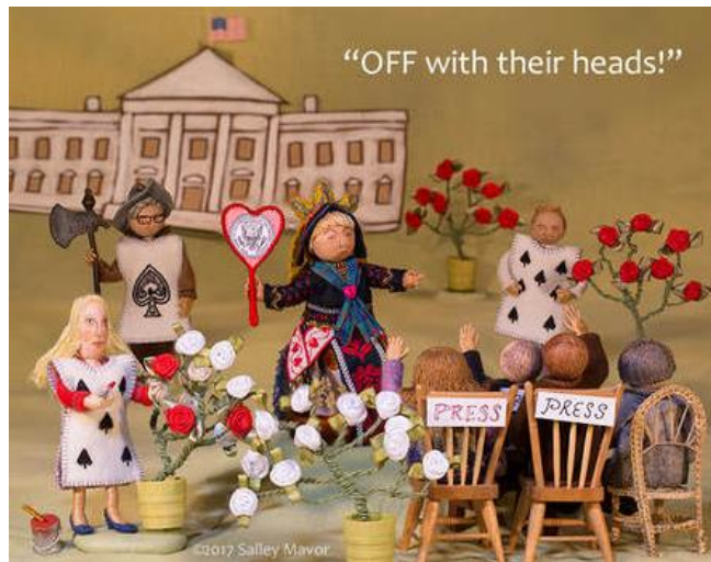
Liberty and Justice: The Satirical Art of Salley Mavor - also thru December 30