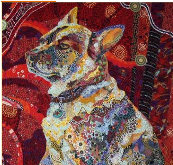
The Fabric Collage Quilts of Susan Carlson – now thru December 30