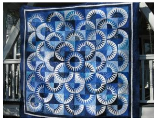
Our Beautiful 2010 Raffle Quilt!!!!